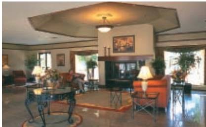
The Radisson features a restaurant and lounge, a swimming pool, fitness facility and meeting space.

Despite its desirable location and first-class amenities and service, the Radisson’s management had, over time, fielded an increasing number of complaints from guests regarding low water pressure and insufficient hot water. In early 2009 they concluded that something needed to be done. Pressure within the hot water pipes had steadily deteriorated over the past 10 years, compelling the hotel’s maintenance staff to set boilers at 150 to 160 degrees Fahrenheit to maintain an acceptable level of hot water. In addition, decades of patching and spot repairs had been made to the system, and the water lines had deteriorated to the point where additional repairs were not possible over a prolonged time frame.